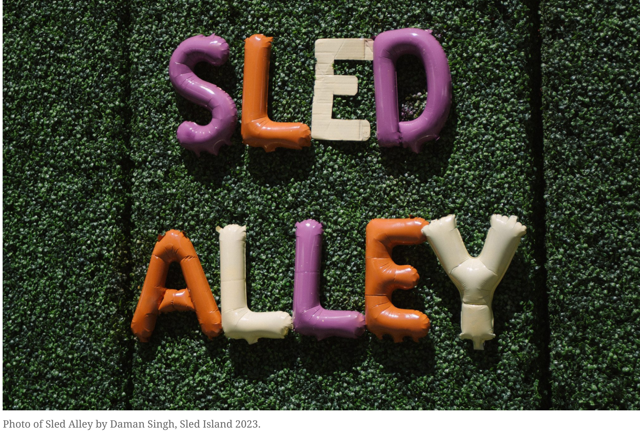
Calgary Folk Music Festival — July 25-28

End Ensemble and taking place at Contemporary Calgary. Showcasing both local and international artists, this music festival caters to diverse tastes after its initial success. Each day will feature numerous concerts as well as pop-up performances, celebrating composers and sound musicians. The three days are jam-packed with concerts to attend to, and the lineup and tickets can be found on the Sound Atlas Festival website.