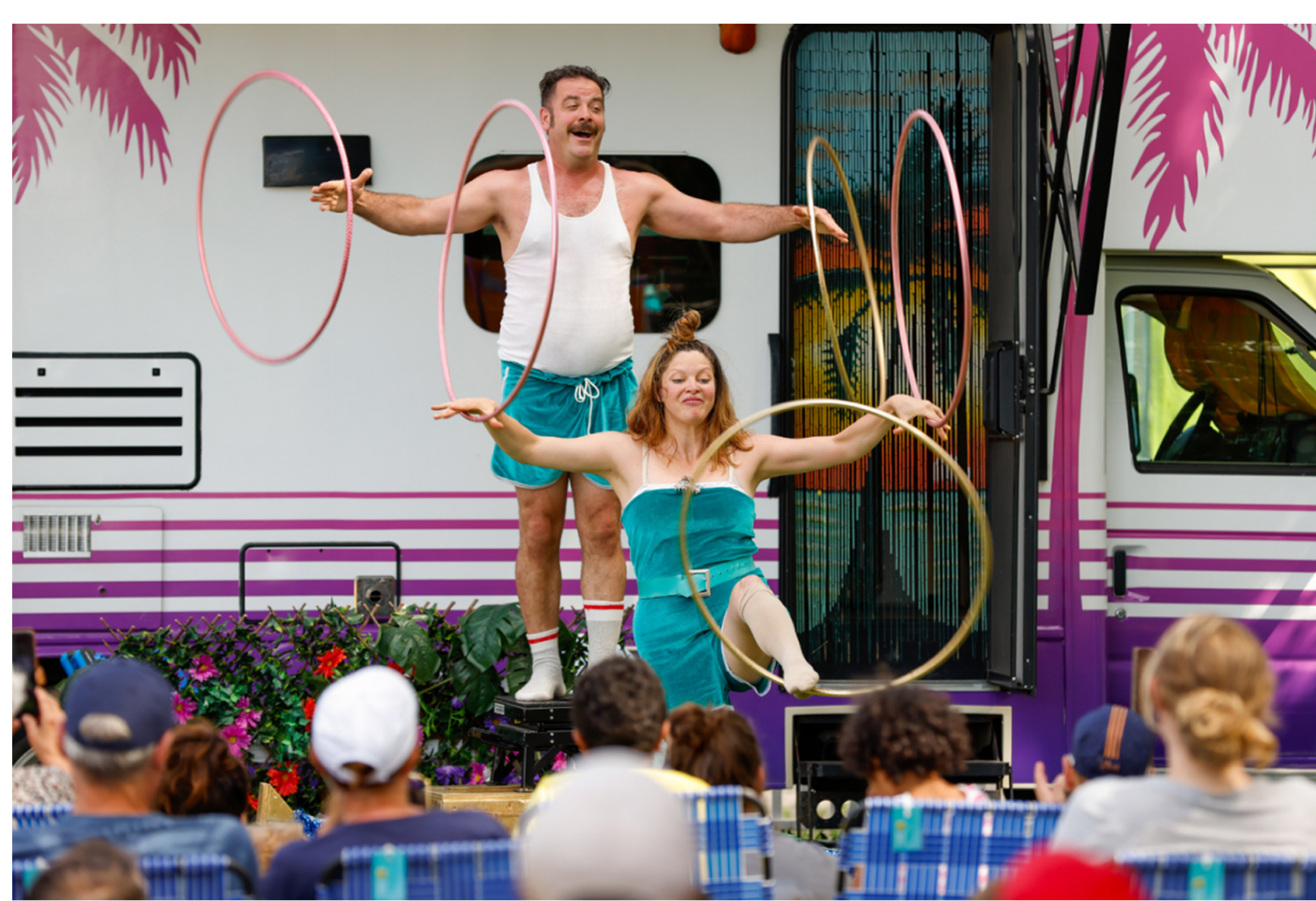
The GoldenCrust family.